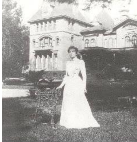
of Bertha at the Palo Alto Mansion.

There are two unrefuted facts in the case. First, that strychnine was found in Mrs. Stanford's bottle of bicarbonate of soda, and second, that strychnine is a foreign substance in bicarbonate of soda.