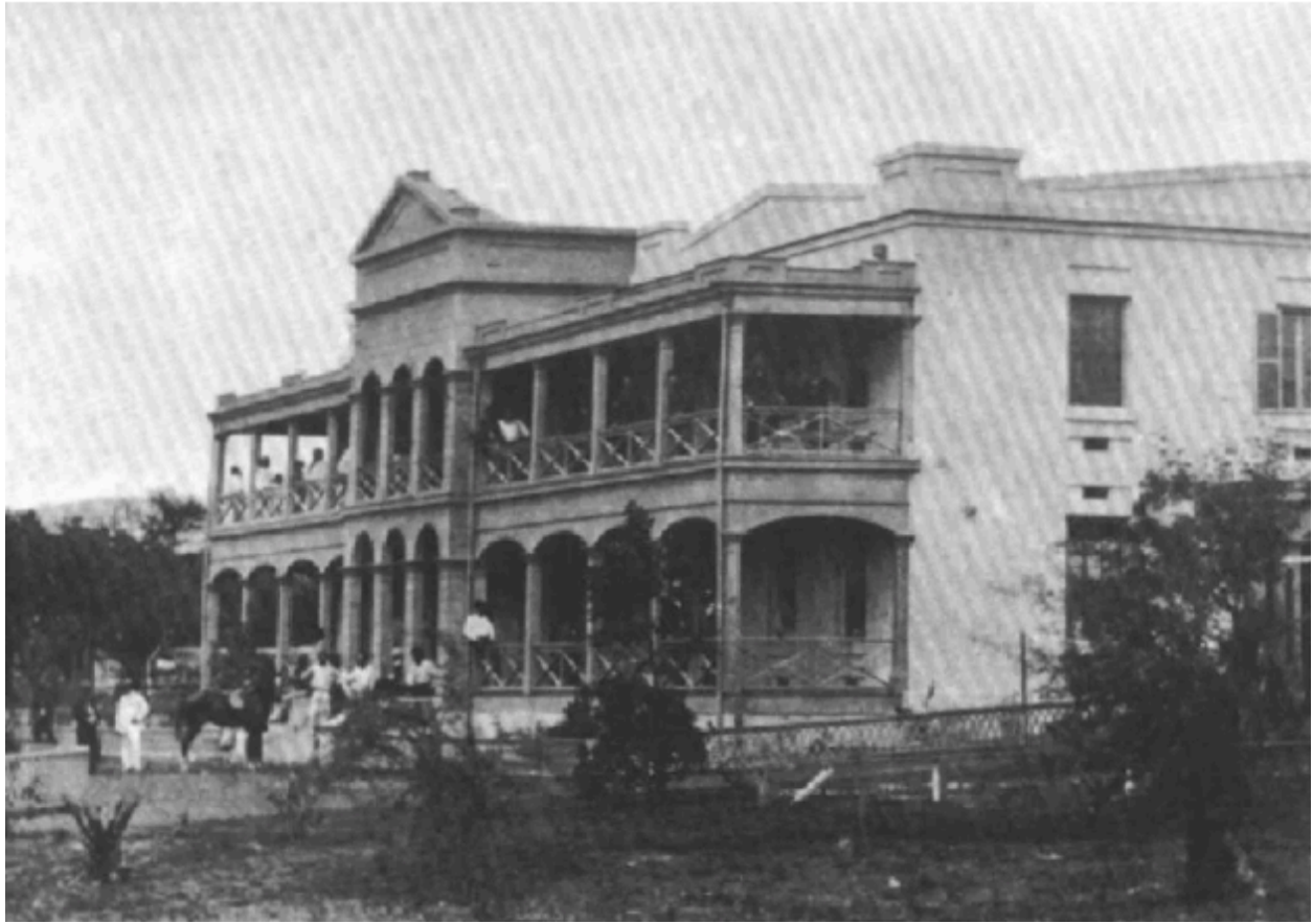
Queen's Hospital.

On March 9, the coroner's inquest jurors delivered their verdict after deliberating less than ten minutes: "Jane Lathrop Stanford came to her death in Honolulu, Island of Oahu, Territory of Hawaii, on the twenty-eight day of February, A.D. 1905 from strychnine poisoning, and strychnine having been introduced into a bottle of bicarbonate of soda with felonious intent by a person, or persons to this jury unknown and of the contents of which bottle Jane Lathrop Stanford had partaken."