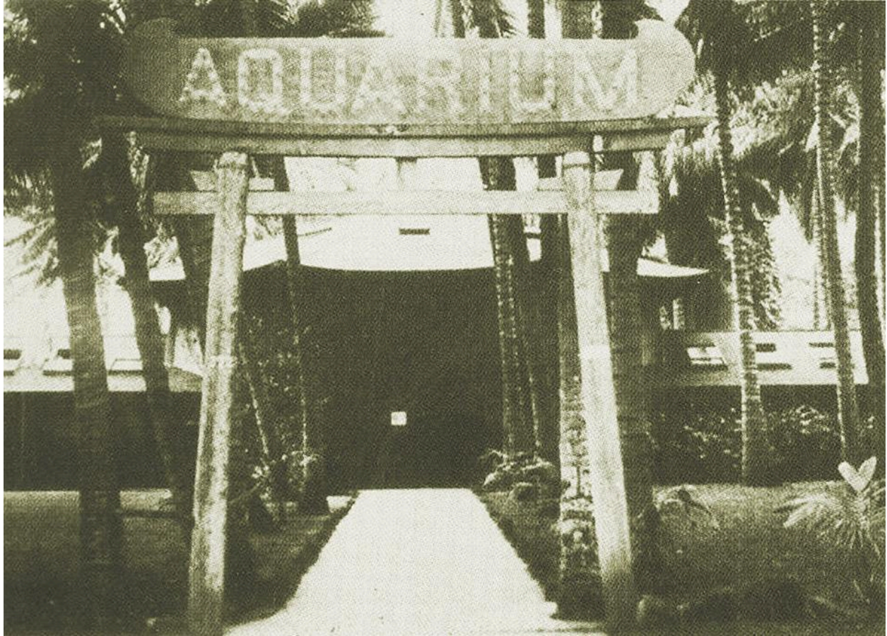
Waikiki Aquarium, then known as Honolulu Aquarium.