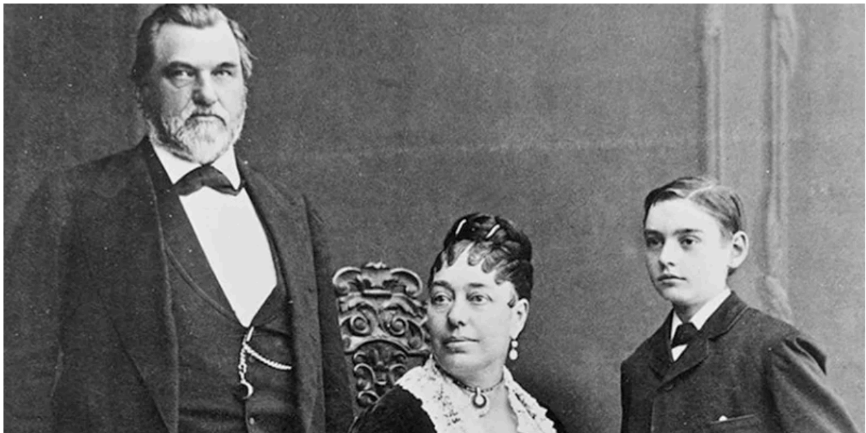
Senator Leland Stanford, Jane Lathrop Stanford, Leland Stanford, Jr.

There are conspiracy theories that imply former Central Pacific Railroad associates of Senator Stanford caused his estate to be inaccessible to his widow, and that they also arranged for the federal government to call in fifteen million dollars of construction loans, leaving Mr. Stanford in dire straits.