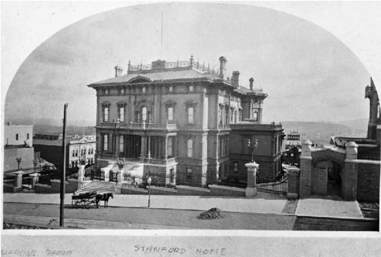
Leland Stanford residence, 905 California at Powell, circa 1880.